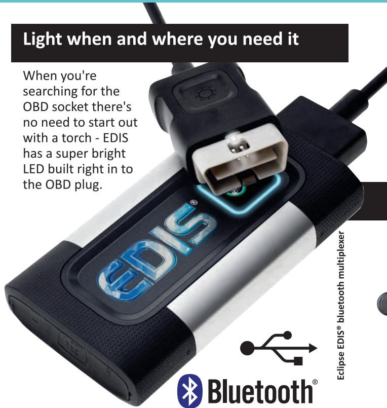
Eclipse EDIS® bluetooth multiplexer

When you're searching for the OBD socket there's no need to start out with a torch - EDIS has a super bright LED built right in to the OBD plug.